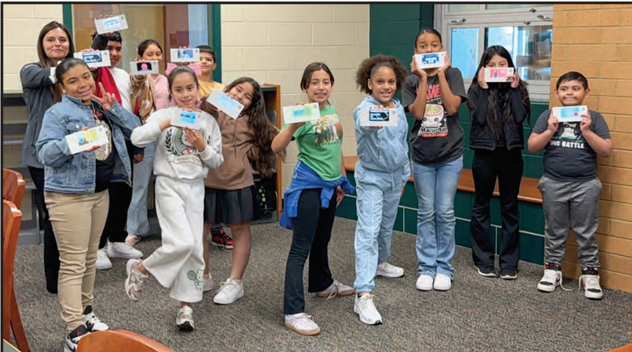
Escuela SMART Academy and Learn Kernel partnership expands opportunities for Toledo students, p. 5